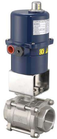
Electric Valve for 922