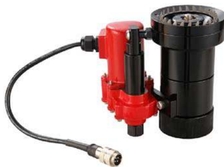
820E Electric Nozzle